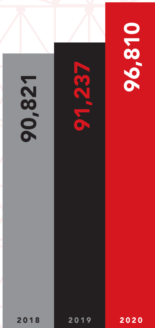
TOTAL NUMBER OF MEMBERS